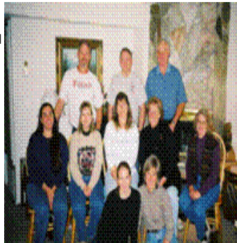
Mission Teams for Russia, Kenya and South Africa at a training session in South Lake Tahoe

The mission teams going to Kenya and South Africa need to raise almost twice as much money as the team going to Russia, so they have a ways to go yet. So far, a little over half of the necessary money has been received, so continue praying that all the funds will be donated that are needed, and if you would like to help send them, send a check to "The Sending Place" marked for Kenya or South Africa mis-