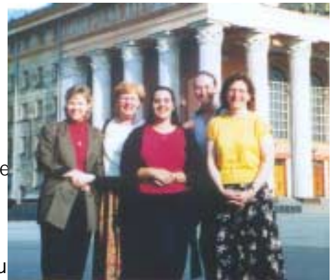
Mission Team in Russia July, 2002

This past summer, our mission team linked up with East European Missions Network to teach English in the public school classes of this city! Using Luke 15 as the English text, many students accepted Christ as their Lord and Savior by the end of each weekly session! Next summer, the opportunities for teaching English, and teaching the Gospel at the same time, are greatly expanded. CAN YOU TEACH? Have you taught in school, have you taught in Sunday School, have you taught your own children? Then ask God if He wants to use you in Russia next summer! The team departs in late May, and returns in mid June.